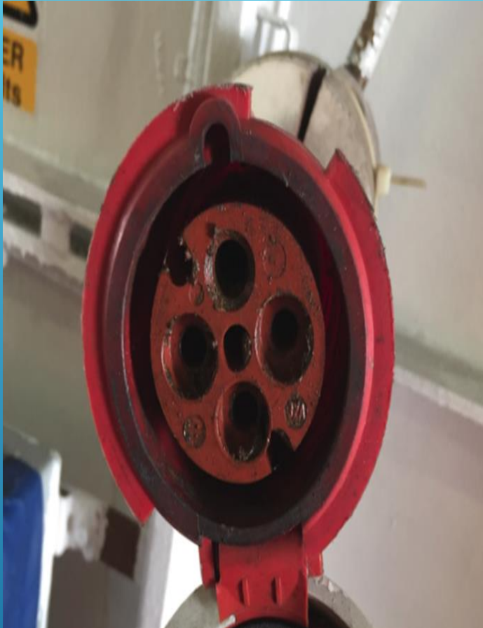
P&O Ferries Onboard Plug In Availability